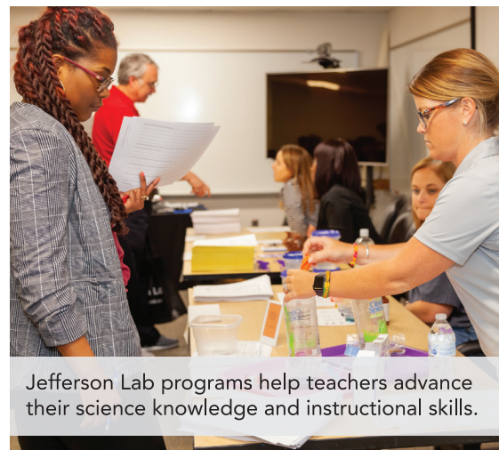
Jefferson Lab programs help teachers advance their science knowledge and instructional skills.

knowledge, learn critical job skills, and gain valuable insight into a world-class research environment. Each summer, dozens of students participate in internship opportunities. Over the years, many of these students have been accepted into prestigious science Ph.D. programs and earned recognition for their work while at the lab.