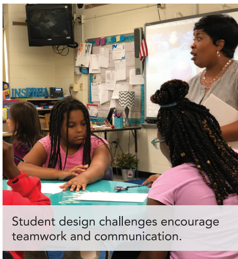
Student design challenges encourage teamwork and communication.

Additionally, with more than a million views each year, Jefferson Lab's